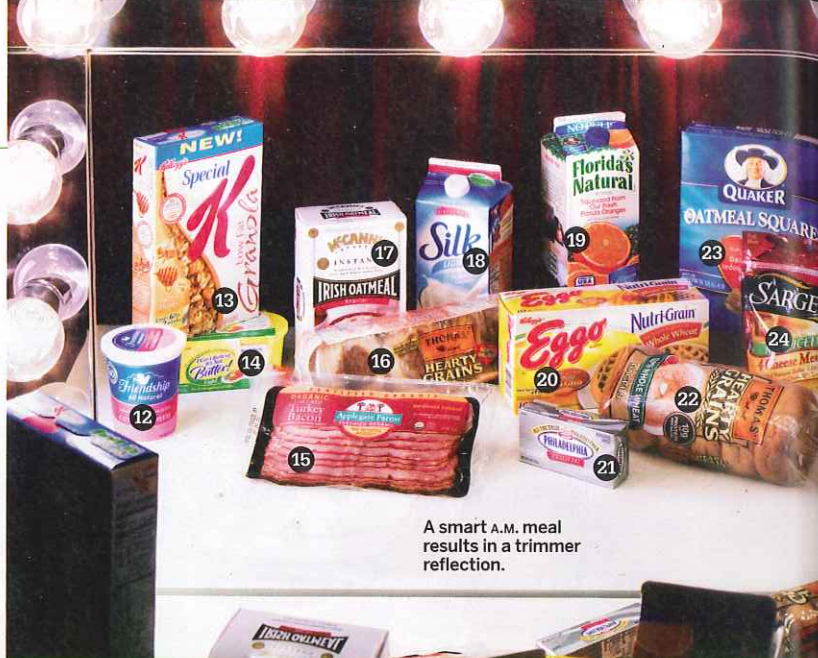
A smart A.M. meal results in a trimmer reflection.

11 Best Nut Blue Diamond Almonds, Honey Roasted (160 calories, 13 g fat per oz) Slightly sweet, slightly salty, slightly—no, make that totally—addictive! Luckily, each serving includes 12 grams of healthy, slimming unsaturated fats, so noshing on these nuts is good for you, too. V